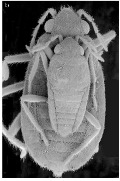
Figure 1 Male Zeus bugs feed on females during mating. a , Females are equipped with a unique pair of dorsal glands, producing a secretion that upon drying creates two oblong, whitish patches (arrows). Scale bar, 0.2 mm. b , Males lack these glands, are much smaller than females ( P. disparata ; 1.2 as opposed to 2.0 mm), and ride adult females, as well as late-instar female nymphs, almost permanently without genital contact (mean mating duration in large laboratory populations; 8.2 ± 2.0 days, n = 10). During riding, the male mouthparts are located at the opening of the female dorsal glands. Adult sex ratio in the field is slightly male biased (1.2:1) and more than 95% of adult females carry a male on their back.

scored the distribution of glandular secretion. The former, but not the latter, females regenerated their patches (Mann–Whitney U-test; P=0.002). Further, the lifespan of starved males increased by about 50% when they were kept with a female compared with those kept alone (2.4\pm0.2\ \text{versus}\ 1.6\pm0.2\ \text{days}; t-test, P=0.014), but there was no significant difference in survival when males were fed (10.6\pm1.4\ \text{versus}\ 13.1\pm1.6\ \text{days}; t-test, P=0.252; ANOVA interaction, F_{1.79}=3.99, P=0.049 ), suggesting that males benefit from feeding on females.